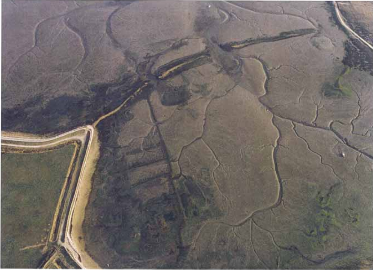
Fig 35 Oyster beds at the head of Prinsted Channel, looking southeast (NMR photo; Aerial photos (i), (j), (k)). The oyster beds are the rectangular structures in the central part of the image