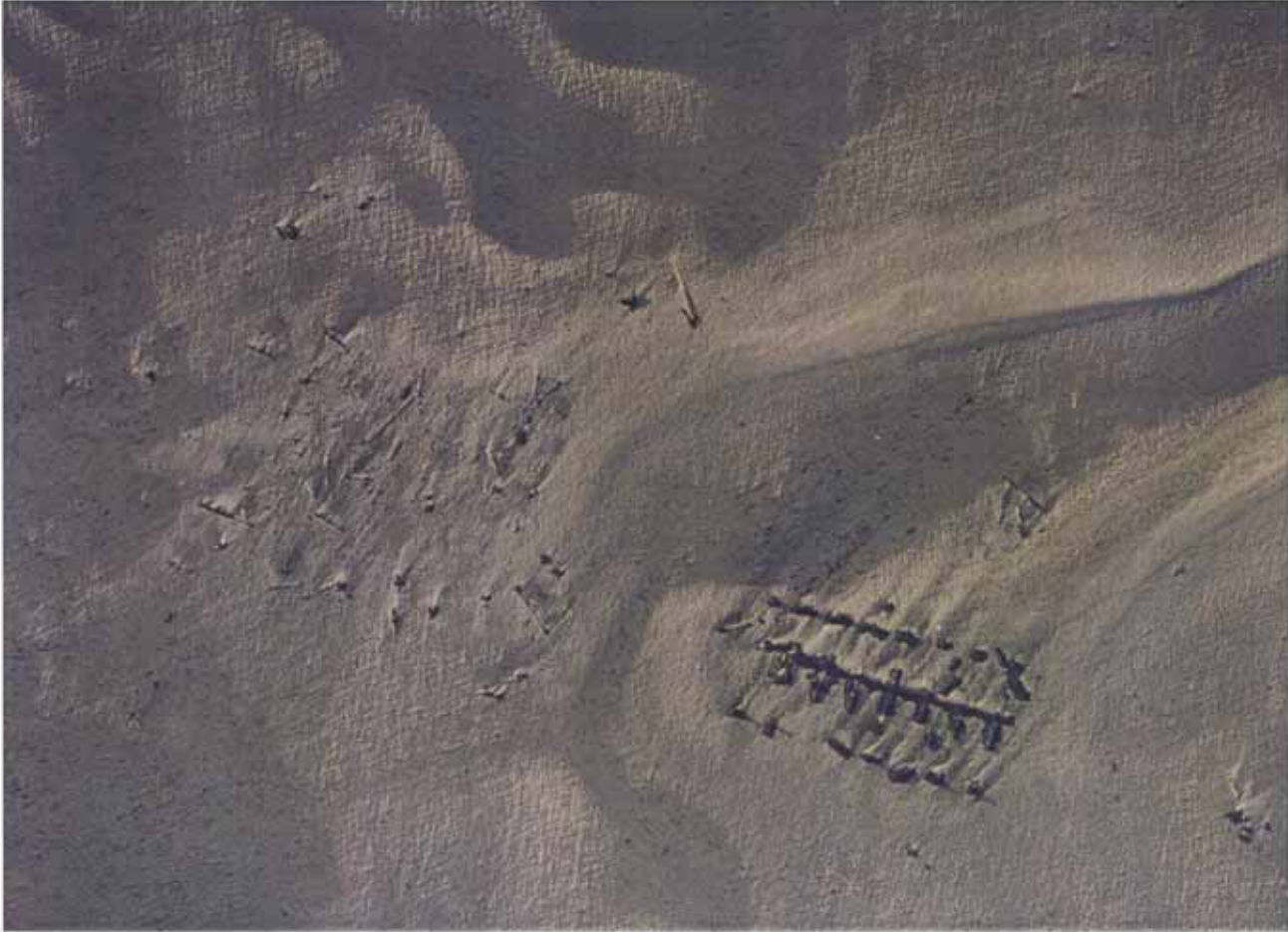
Fig 36 A wreck on Pilsey Sand. The hull of the ship is deep in mud, with spars and other timbers scattered to the southwest