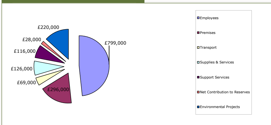
Expenditure 2008-9 £1,654,000

£439,000 was spent on the AONB area which included a range of projects such as the installation of new interpretation boards at popular locations