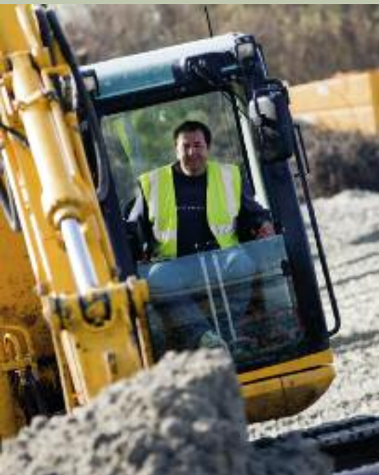
Top: working to improve the sea defences and footpath on the popular route north of Dell Quay