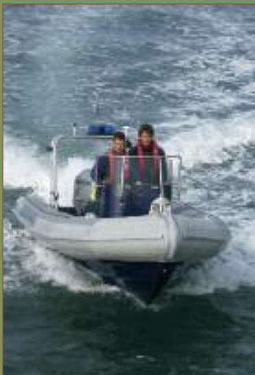
Below: The Harbour Patrol team provide essential support on the water for the many thousands of people who use Chichester Harbour