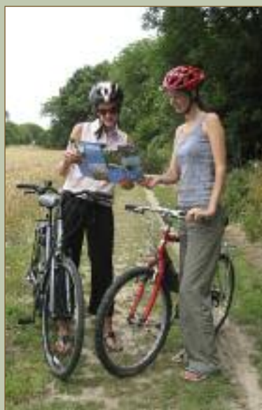
Below: cyclists enjoy the Salterns Way route which provides a safe and scenic link between the city and the sea

The threat of climate change and associated sea level rise causes concern for the potential loss of the harbour's intertidal habitats through coastal squeeze, and the erosion of the valuable coastal footpaths. The Conservancy continues to monitor the impacts of climate change on coastal habitats and species, and to identify projects to secure long term access to the harbour's shoreline paths.