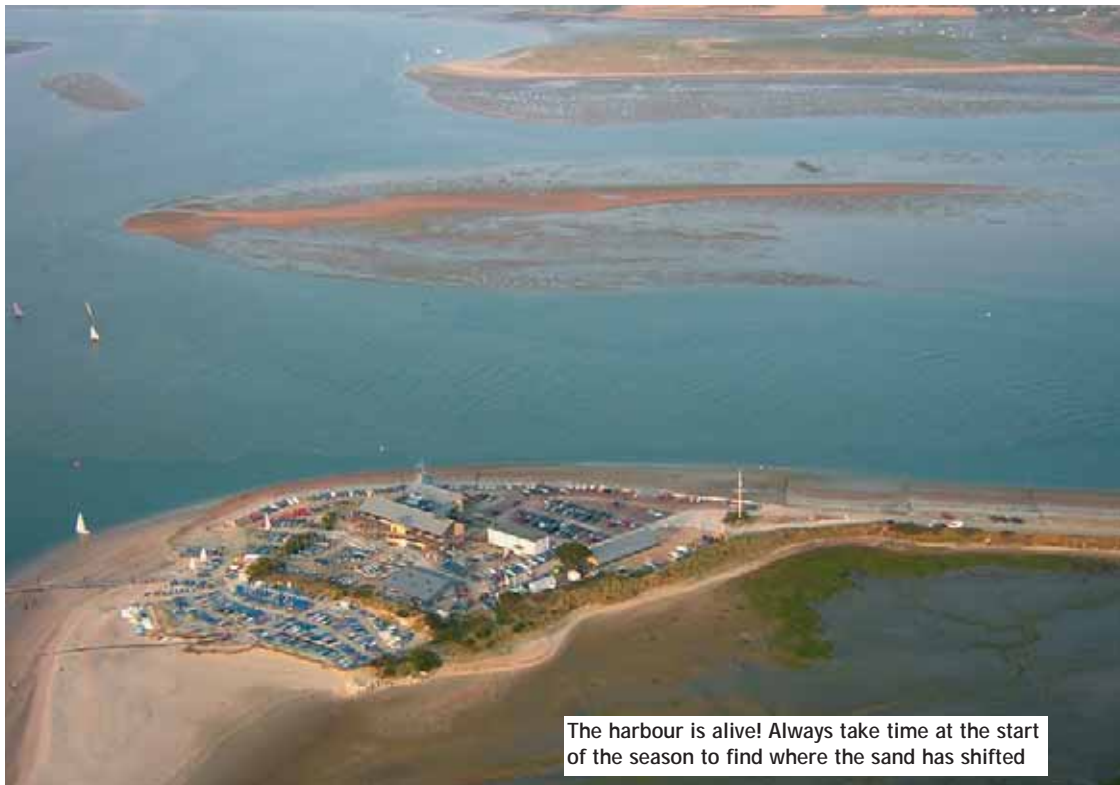
The harbour is alive! Always take time at the start of the season to find where the sand has shifted

Strength: Beating against the tide up the Emsworth channel, it is simply a matter of taking advantage of the weaker stream over the shallower water on either side of the channel. On a short beat we'd normally look at the windward and leeward mark and pick the side which involves the shortest crossing of the main tide. On a longer beat we'd choose the side which gives the biggest expanse of shallow water, in this case the eastern shore. An eddy gives double the gain: we've found eddies near Hayling Island Sailing Club (HISC), south east of Pilsey Island, and behind East Head. Spot the current strength and direction from the wash around withies and moored boats. Notice when the current is dropping or turning from the direction the moored boats are lying.