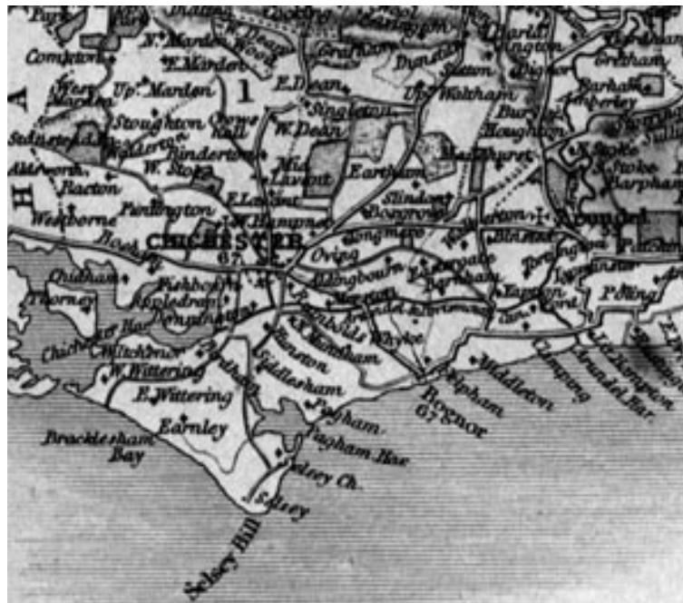
Fig 31 The Chichester map by Dugdale of 1840